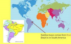
Samba – Where is it from ??

*It is important to know that a big part of Brazil's history was the Slave Trade and that Samba originated from the culture and traditions of the African slaves living and working in the Brazilian sugar plantations at the time