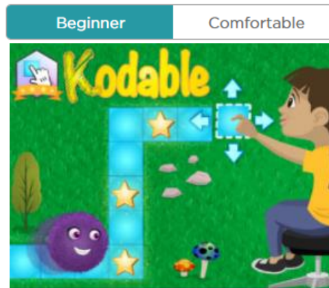
Make Your Own Kodable Mazes Pre-reader - Grade 5 | JavaScript, Language independent (can be taught in multiple languages)

Weblink: https://hourofcode.com/uk/learn