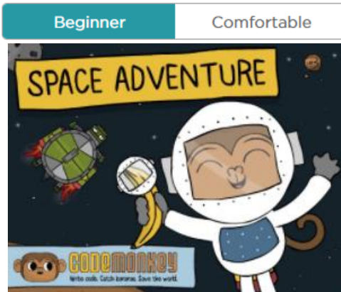
Space Adventure: Write Code and Ca... Grades 2-8 | CoffeeScript

Weblink: https://hourofcode.com/uk/learn