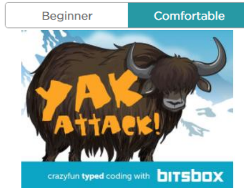
Yak Attack! Make a Card with Typed ... Grades 2-8 | JavaScript

Weblink: https://hourofcode.com/uk/learn