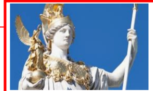
Athens was named after the Goddess Athena

Rome was growing Worthing was mostly farming land