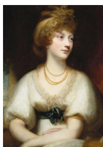
Princess Amelia Visited in 1798

As more important people visited and it developed better transport links to locations like London.