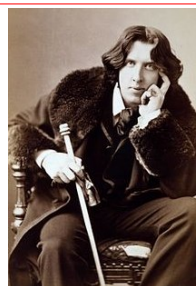
Oscar Wilde Playwright Visited 1894