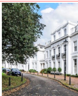
Park Terrace Part of a terrace built for Princess Amelia