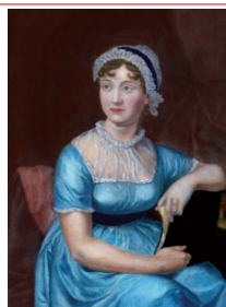
Jane Austen Author Visited 1805