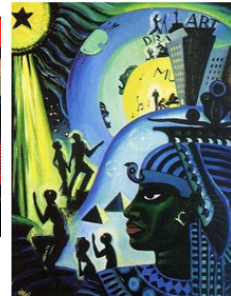
The Ascent of Ethiopia (1932) – Oil on canvas