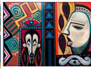
Dream of Nigeria (1971) – Acrylic on board