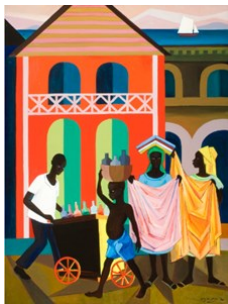
Street Vendors in Haiti (1978)