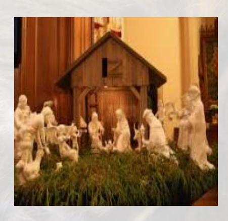
Away in a Manger