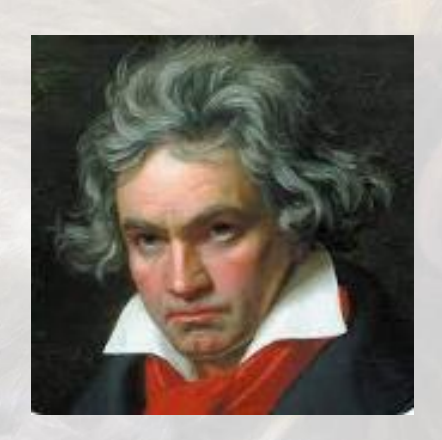
Beethoven Fur Elise

Dream, Aspire, Achieve – Be Extraordinary