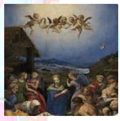
Hark the Herald Angels Sing