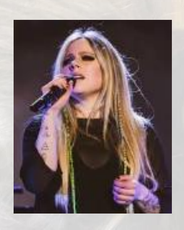
Beethoven Fur Elise