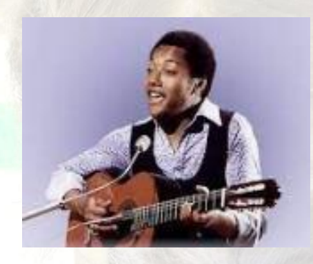
Labi Siffre Something Inside So Strong