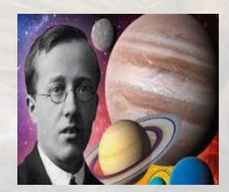
Gustav Holst World In Union