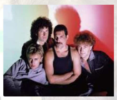
Queen We Are The Champions