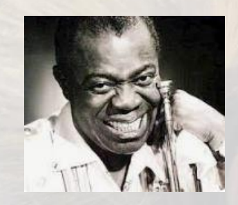
Louis Armstrong What a Wonderful World