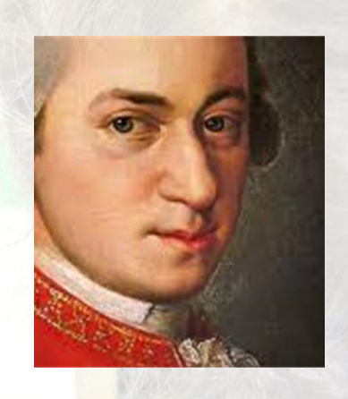
Mozart Queen of the Night The Magic Flute