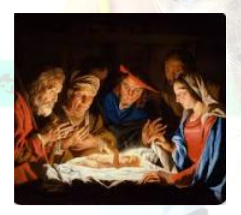
O Come All Ye Faithful