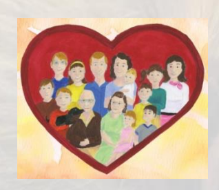
We are one big family School Anthem