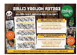
The Outdoors Project – ST Nics Primary School