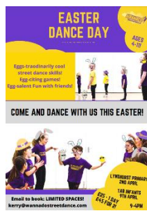
Wannado – Easter dance day