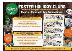
The Outdoors Project – Lancing Prep