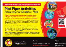
Pied Piper Activities