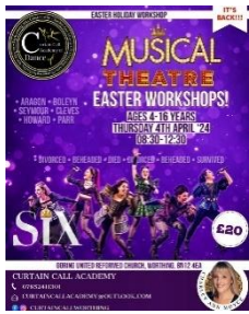
Curtain Call Academy