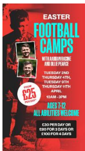
Easter Football Camps at Worthing Football Club