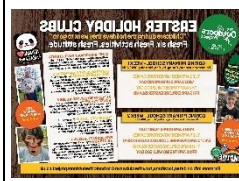
The Outdoors Project – Goring Primary School