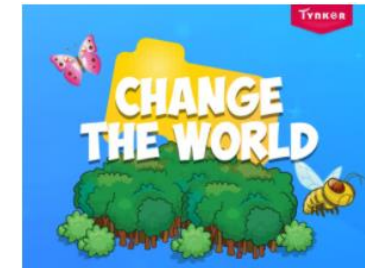
Change the World

Weblink: https://hourofcode.com/uk/learn