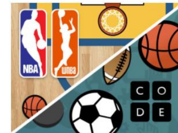
Code your own sports game